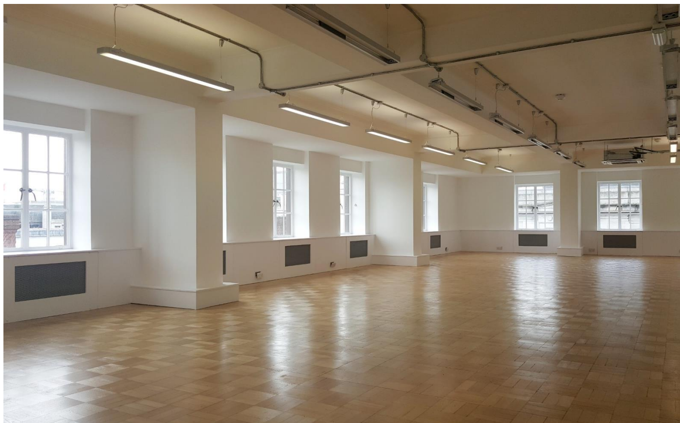
Photo showing the part 6th floor