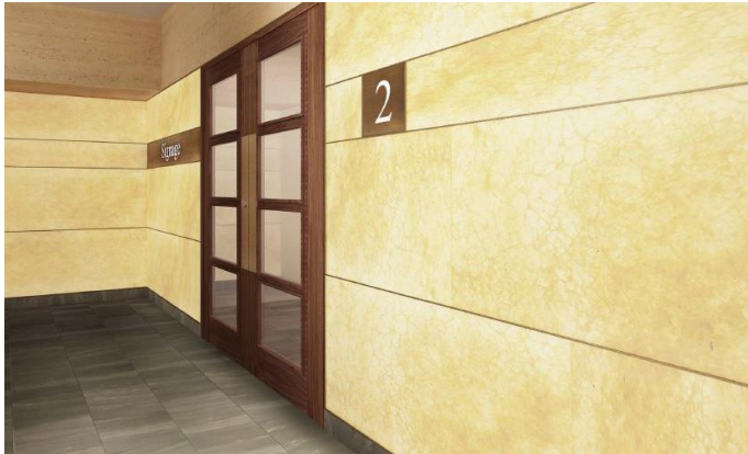
Proposed common part refurbishment CGI