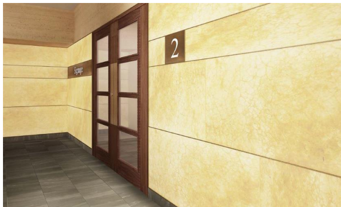
Proposed common part refurbishment CGI