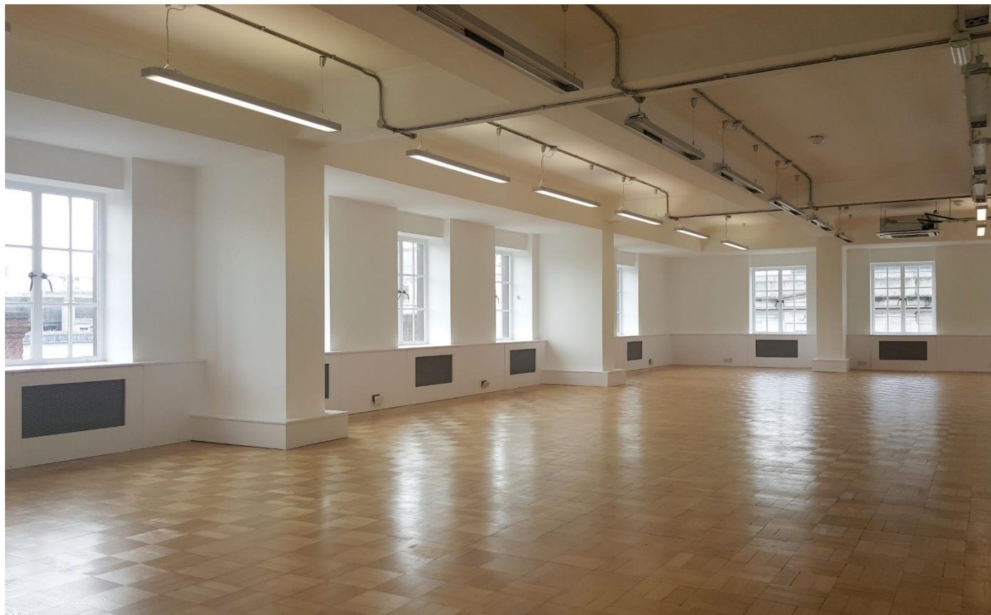
Photo showing the part 6th floor