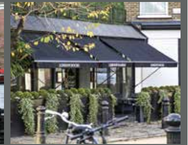
1. Pizza Express 3. The Butcher Grill 2. Draff House