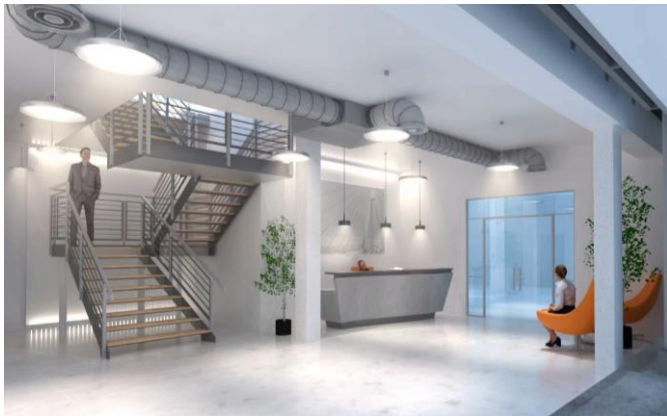
*CGI of ground floor reception