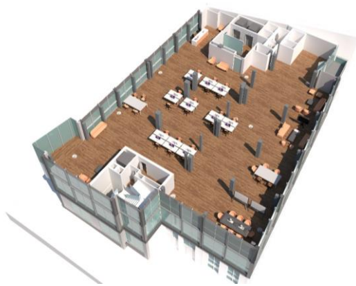
*Indicative 3D model