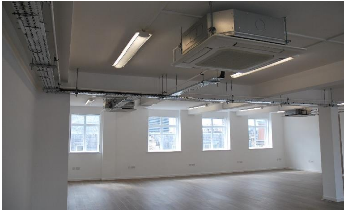
Internal photograph is for indicative purposes only