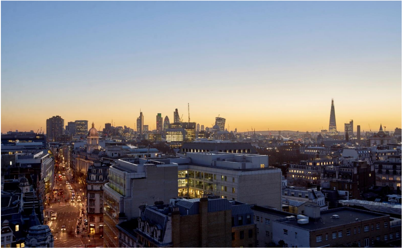
*View from the building